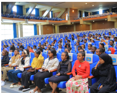
Awardees in front row at the ceremony

Thus far a cumulative 38 students have been awarded this scholarship. Mehal Medal Secondary School currently leads with the most scholarship awardees (10) followed by Shewarobit Secondary (7). 90% of the scholarship cost is funded by 2 Dir Biyabir donors and the remaining 10% is covered by Dir Biyabir general funds.