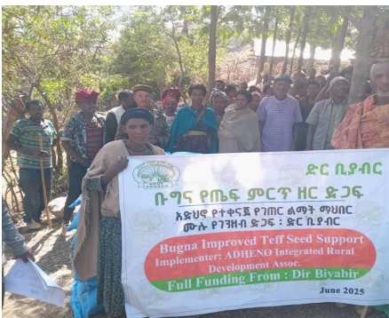
Teff Seeds Distribution To Farmers in Bugna

Over the years, Dir Biyabir has gradually grown by showing that those of us in the West can make a real impact by funding grassroots projects that transform lives in Ethiopia. We've always made transparency and accountability central to our work, sharing updates, photos, and reports so you can see exactly where your generosity goes. None of this would be possible without you and especially a very small but steadfast group of donors who have carried this mission forward year after year. We are deeply grateful to them—their commitment keeps Dir Biyabir alive and strong.