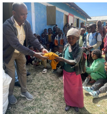
Uniforms being handed out

In Phase 2 (November 25) : uniforms were purchased and distributed to 200 of the neediest children at Zanjira Primary School. Most (about 70%) of these 200 are children whose families were