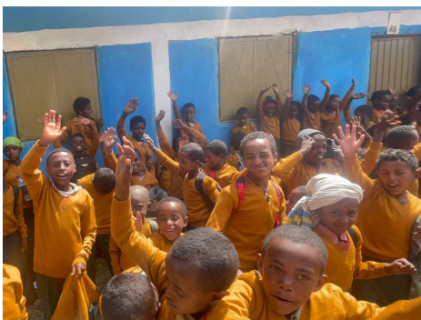
Kids getting uniforms at Zanjira Primary

We thank YOU, the members and donors of Dir Biyabir for enabling us to implement these critical, life-saving and life-changing projects in Ethiopia in 2025. One thing we can clearly see is that with highly effective, competent, and transparent local partners like Adheno, meager funds can be stretched to make a very high impact on people's lives.